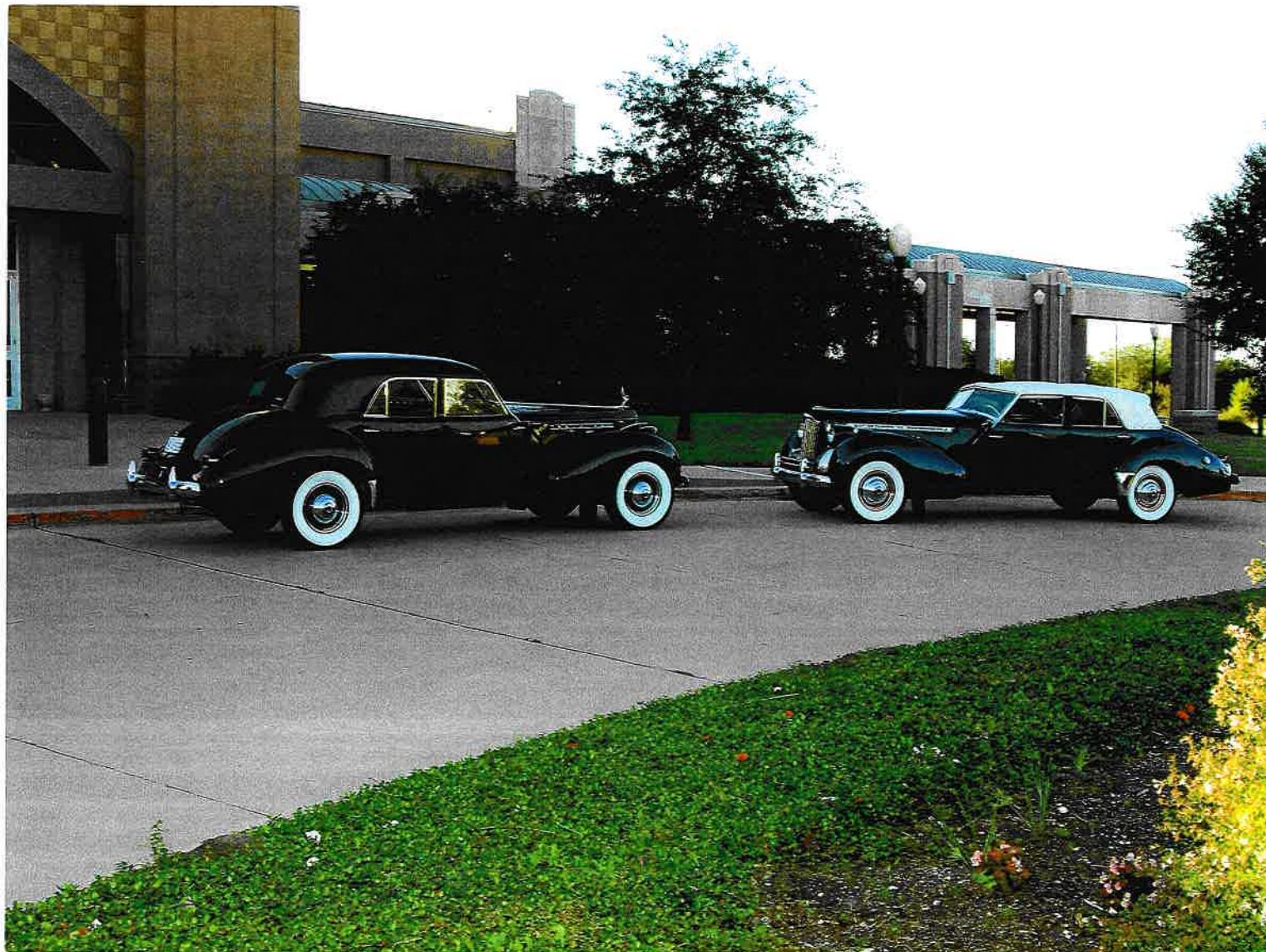
THE PACKARD DARRIN SPORT SEDAN AND PACKARD DARRIN SPORT CONVERTIBLE SEDAN