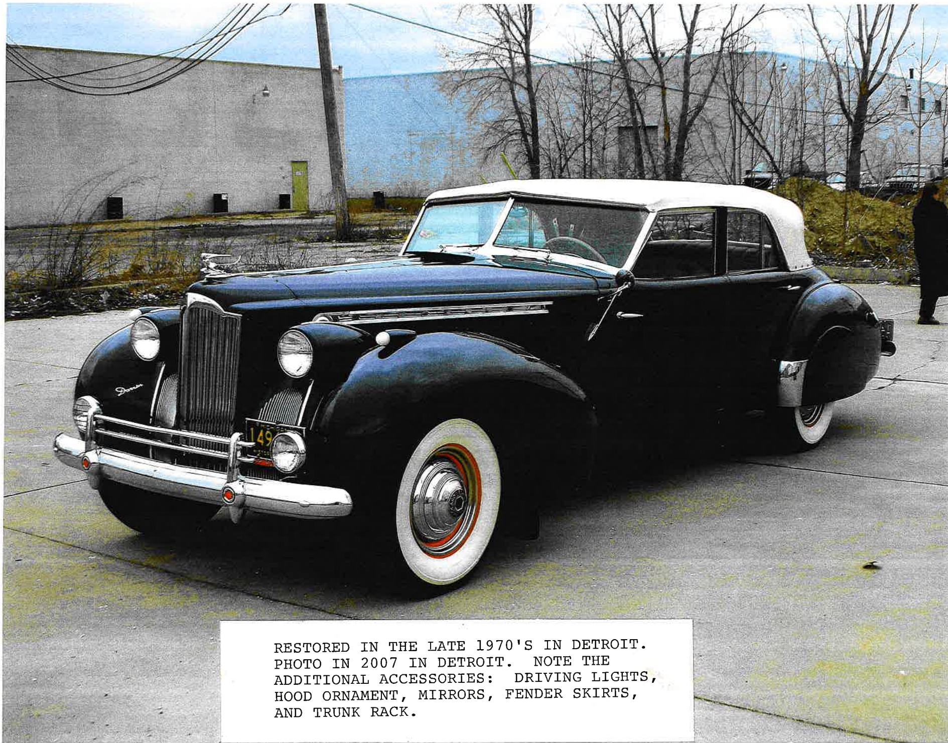
RESTORED IN THE LATE 1970'S IN DETROIT. PHOTO IN 2007 IN DETROIT. NOTE THE ADDITIONAL ACCESSORIES: DRIVING LIGHTS, HOOD ORNAMENT, MIRRORS, FENDER SKIRTS, AND TRUNK RACK.