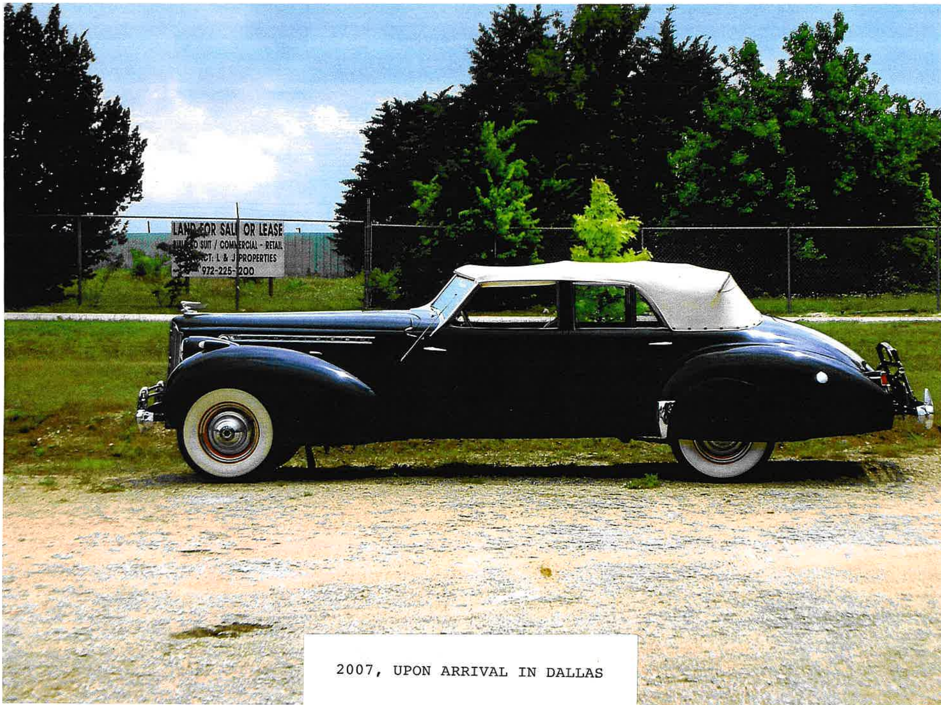
2007, UPON ARRIVAL IN DALLAS