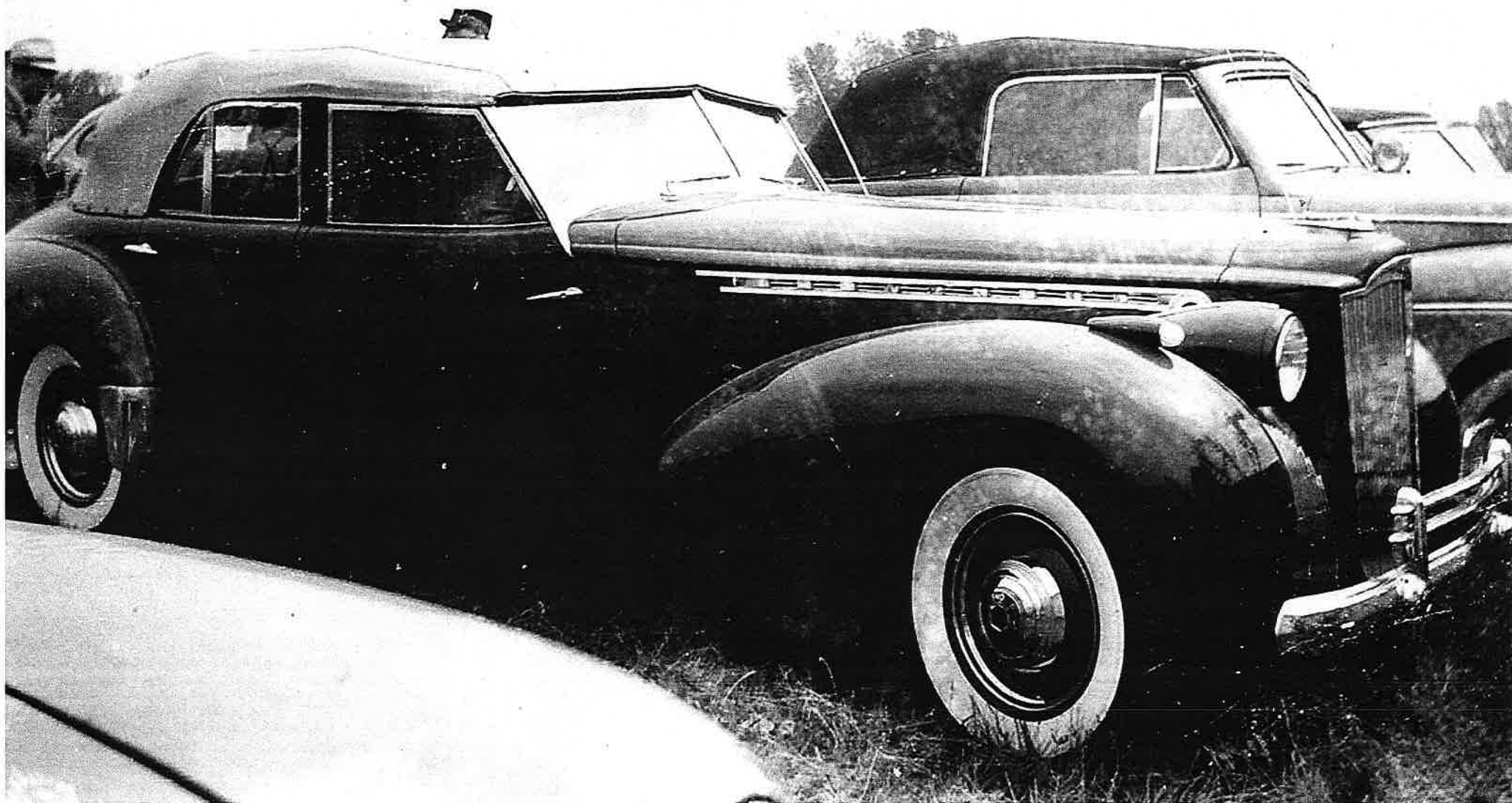
1940 PACKARD 4DR. CONV PICTURE TAKEN 5-30-41 THE CAR WAS OWNED BY GORDON FAIRBANKS PICTURE TAKEN IN INDIANAPOLIS