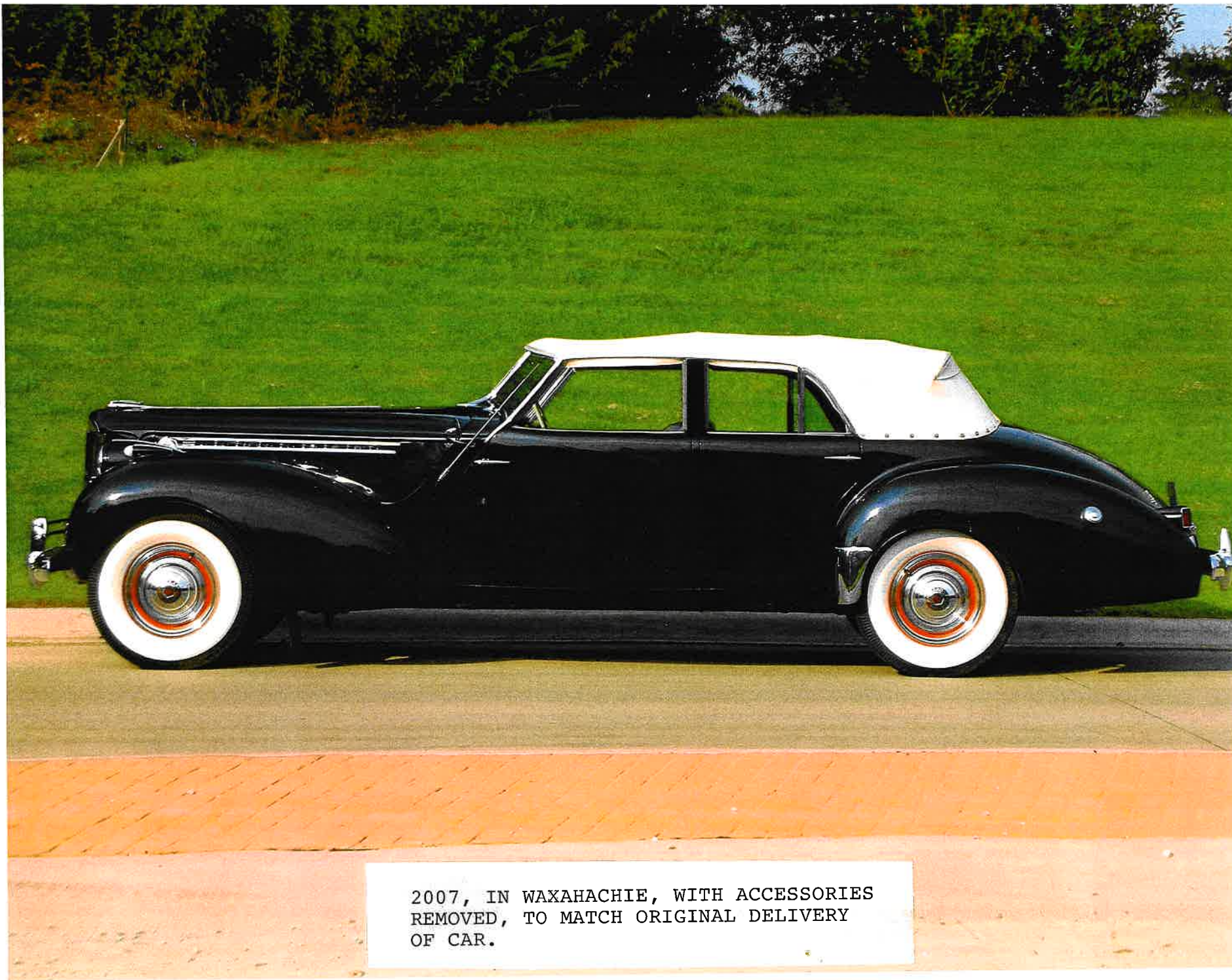
2007, IN WAXAHACHIE, WITH ACCESSORIES REMOVED, TO MATCH ORIGINAL DELIVERY OF CAR.